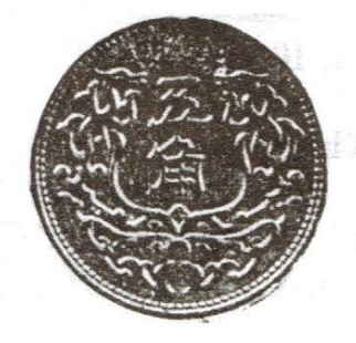
Meng Chiang Bank 5 chiao of 1938.