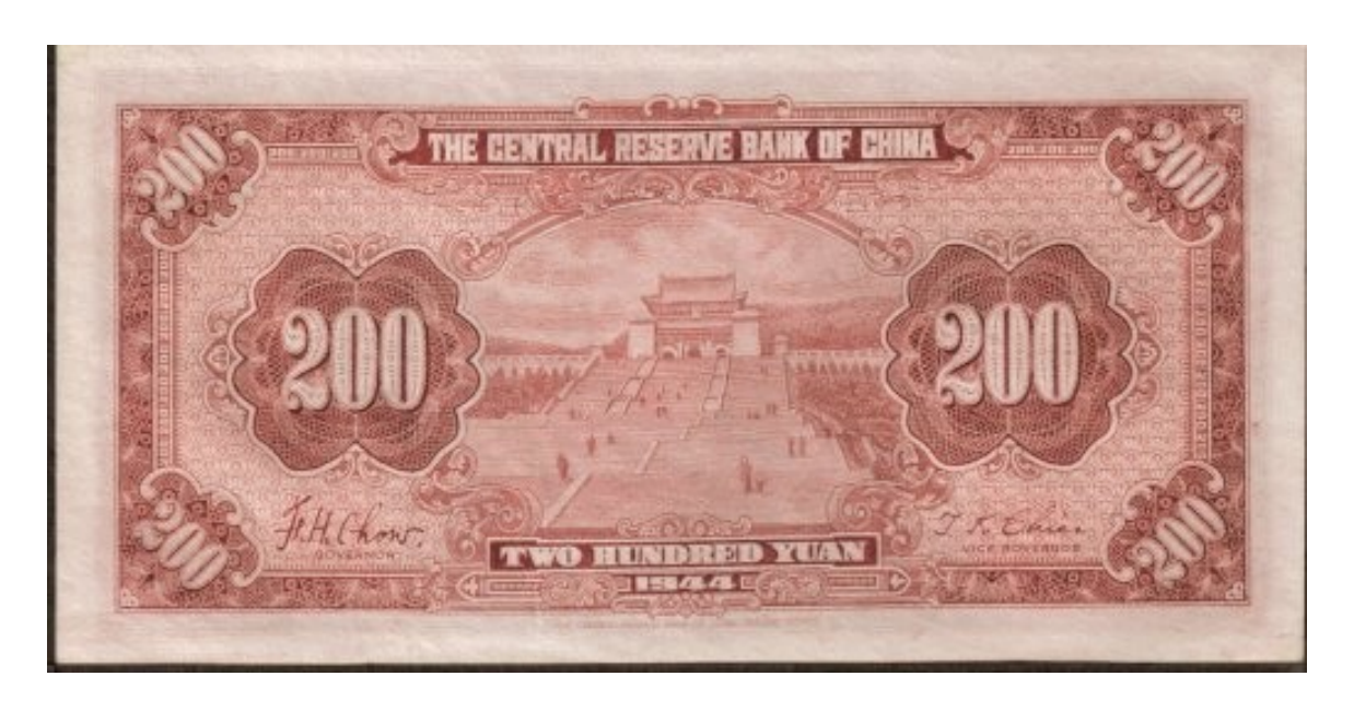
This is the famous CRB note onto which the propaganda message "U", "S", "A", "C" standing for "United States Army (is) Coming!" was secretly engraved into the intricate lathe work on the note.