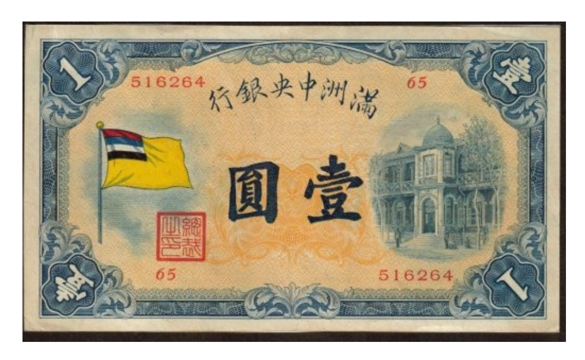
The first notes authorized by the newly established Manchukuo government all bear the same design except for valuation. All show the national flag at left, and the head office of the Central Bank of Manchukuo in Hsingking at right.

presses, Manchukuo coins were minted there under Japanese supervisors on loan from the Osaka mint. The first coins produced at the new mint were the nickel fen and chiao of 1933.