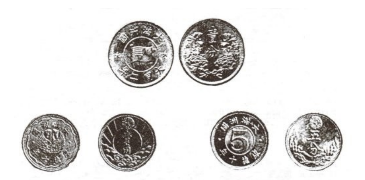
The bronze 1 fen, Ta T'ung year 2 (1933), copper-nickel chiao K'ang Te year 7 (1940) and aluminum 5 fen K'ang Te year 10 (1943) typify the coinage of Manchukuo.

presses, Manchukuo coins were minted there under Japanese supervisors on loan from the Osaka mint. The first coins produced at the new mint were the nickel fen and chiao of 1933.