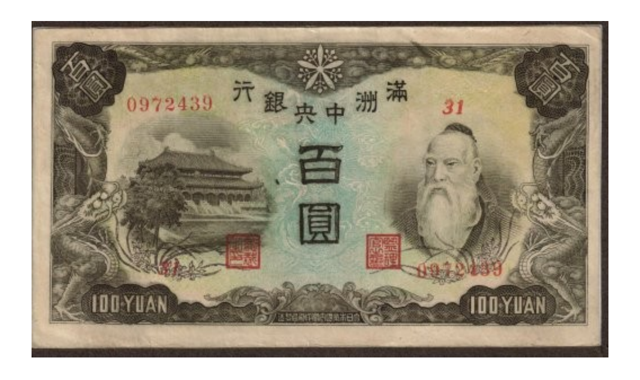
Typical of the third issue of Manchukuo bank notes were these 5 and 100 yuan specimens. The building on the 100 yuan note is the Hall of Great Accomplishments (Ta Cheng Tien) in Chefoo.