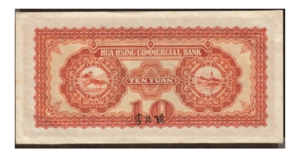
Face and Back of the 10 yuan Hua Hsing Commercial Bank note, a Japanese puppet bank set up in the commercial district of Shanghai. The 10 yuan was it's highest denomination. These notes were the work of the Letterpress Printing Company of Tokyo. The bank's existence spanned a mere twenty months.