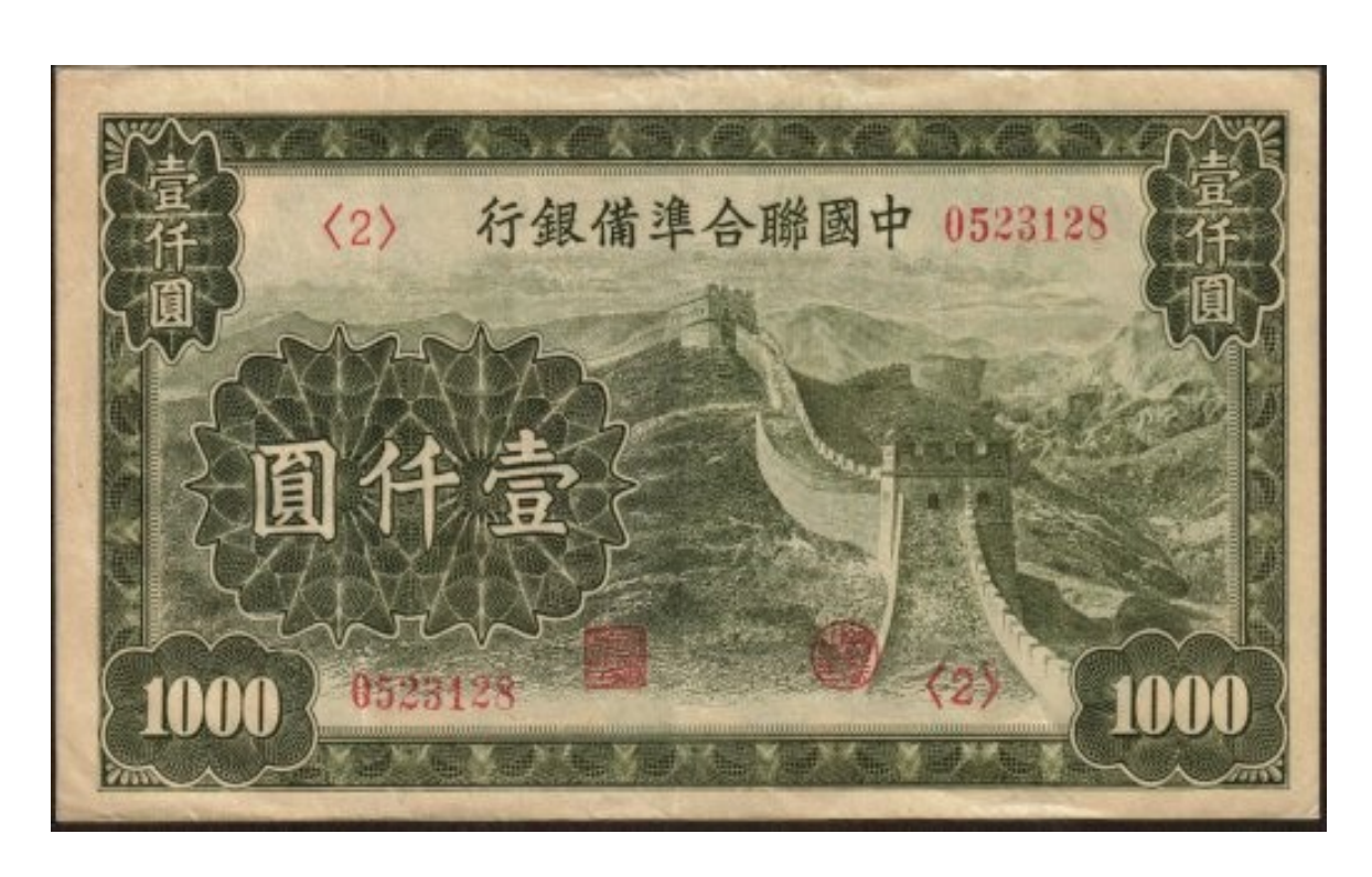
The ever popular Great Wall of China was the subject of this undated 1000 yuan note probably released in 1943.

The small fractional note series was typically denominated in both cents (fen) and chiao as seen on this fifty cent example.