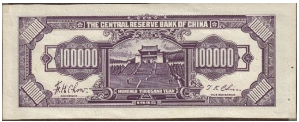
100,000 yuan note of 1945. By this date the Japanese abandoned all attempts to track bank notes by serial number, substituting instead three block letters for control purposes.