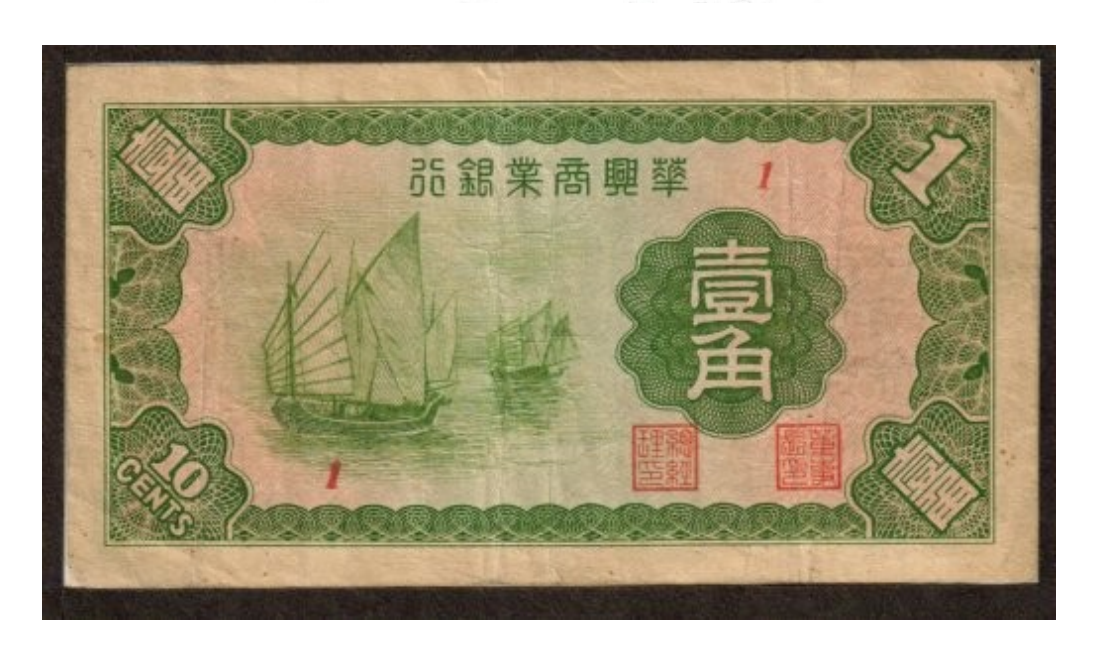
Hua Hsing Commercial Bank 10 fen coin in copper-nickel, dated 1940 together with the 1 chiao bank note of the same denomination. Notice the denomination "1" in the upper right hand corner of the note. This stands for "1 chiao", a term of Manchurian usage, which was the equivalent of 10 Chinese fen, or 10 cents.