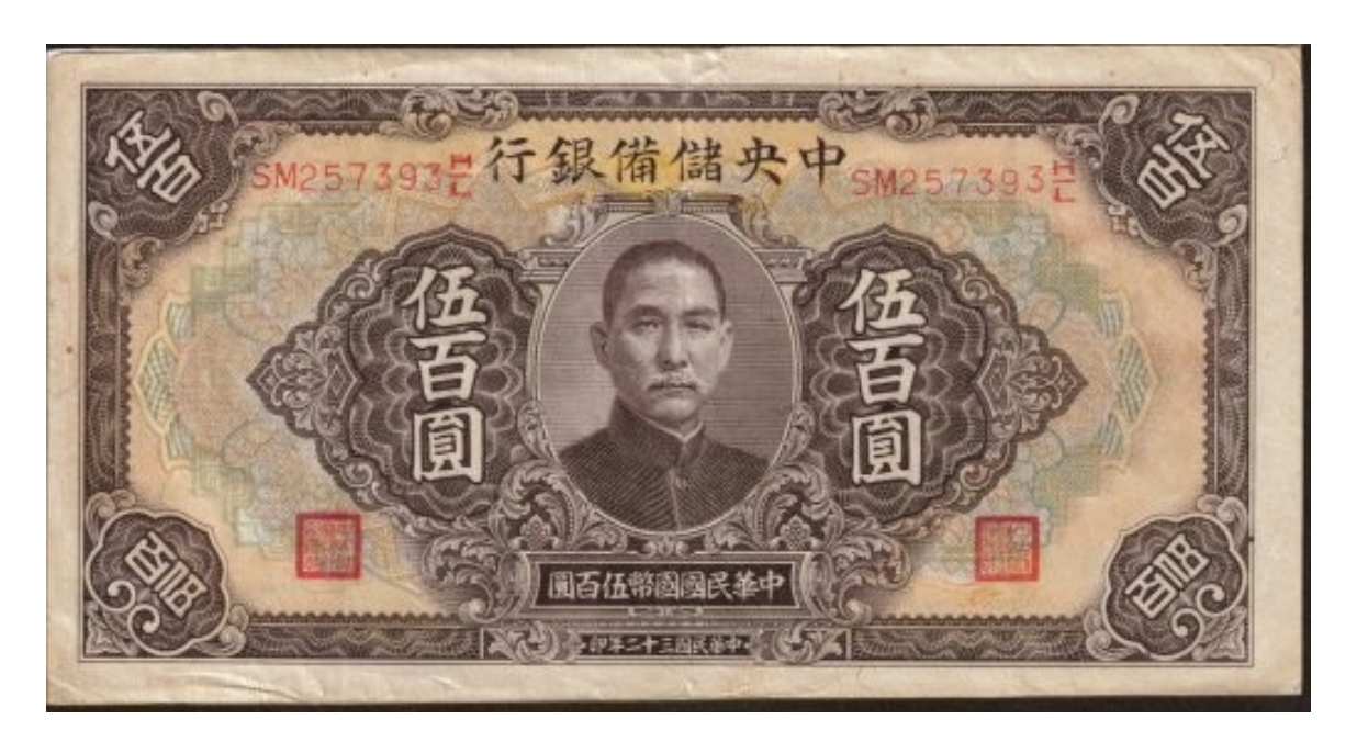
500 yuan CRB note of 1943

As the war dragged on with the Japanese unable to complete their conquest of China, and the Chinese too weak to drive the Japanese armies from their territory, inflation began to take its toll. On 24 June 1944 the 500 yuan denomination appeared for the first time (although dated 1943). Notes of 1000, 5000 and 10,000 yuan soon followed. Finally, faced with rapid depreciation, a 100,000 yuan issue was released in the last days of the war. By the early summer of 1945 the velocity of depreciation became so rapid that production of paper money could not keep up with demand, notwithstanding the high denominations then circulating. Central Reserve Bank management abandoned any further attempt to place serial numbers on its notes, substituting instead three letters placed within brackets in a feeble attempt to maintain control over its output. Their use was probably little more than a formality as by this time the bank was not even registering its note issue on its books. As soon as they left the printing presses, CRB notes were delivered in bulk to waiting Japanese army trucks, which hauled the money away.