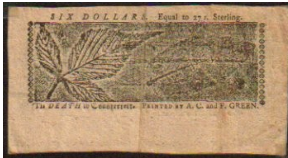
Maryland Colonial 6 dollars of 10 April 1774