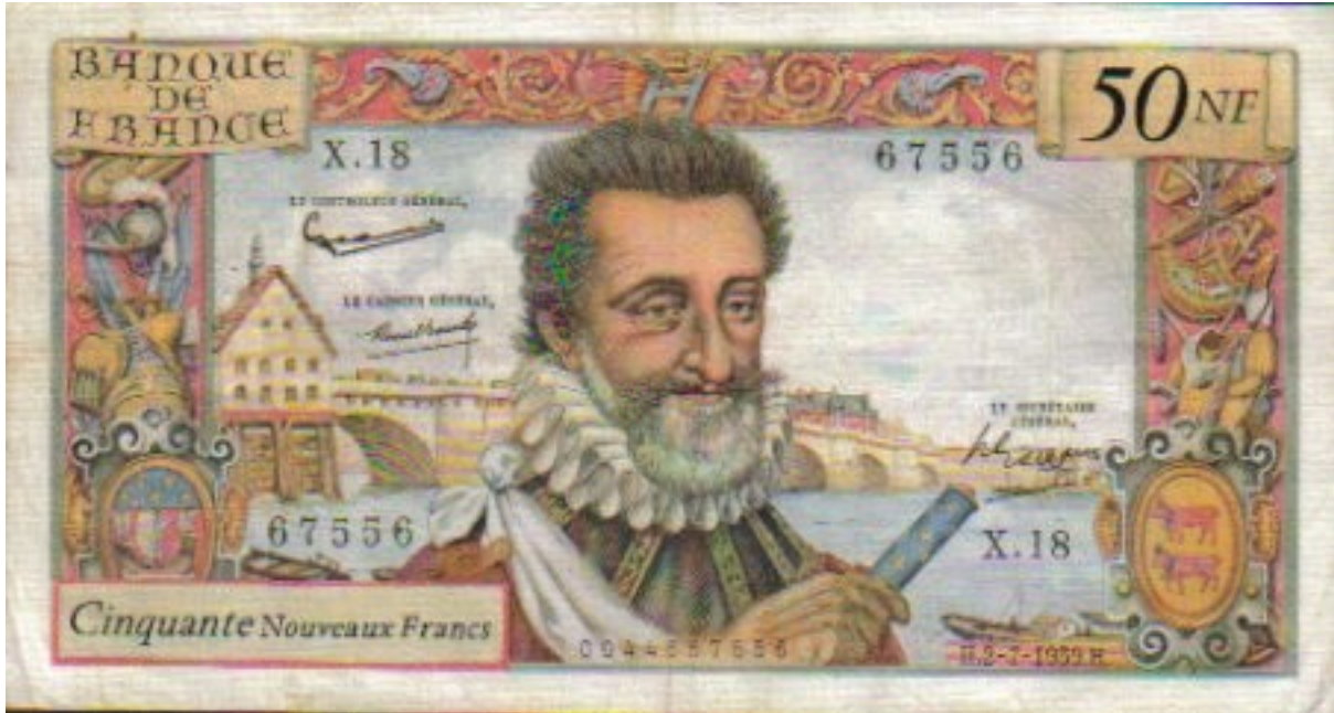
Banque de France, 50 nouveaux francs, 1959.